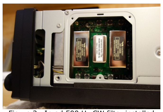
Figure 2. Inrad 500 Hz CW filter installed